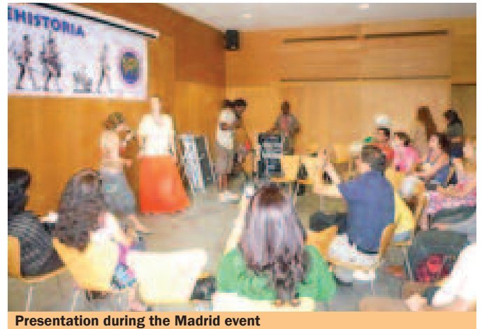
Presentation during the Madrid event