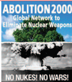
Abolition 2000 INTERNATIONAL NONVIOLENCE

Emergency provides medical treatment to civilian victims of war. "Emergency feels like a participant on a path that crosses the places in which human beings live. To think and to define the Earth in this way, without references to borders and flags, means the involvement of all in the fate of everyone. Peace is not the interval between two wars. Peace is the politics of friendship."