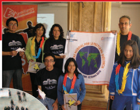
Making paper cranes in Quito

This year the cranes are dedicated to the World March.