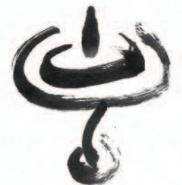
Unitarian Universalists HONG KONG RELIGIOUS & SPIRIT.

The Agency for the Prohibition of Nuclear Weapons in Latin America and the Caribbean is an inter-governmental agency created by the Treaty of Tlatelolco to ensure that the obligations of the Treaty are met. The Treaty established the creation of a Nuclear Free Zone throughout the region. OPANAL also supervises the adherence to the Control System and the obligations stemming from the Treaty.