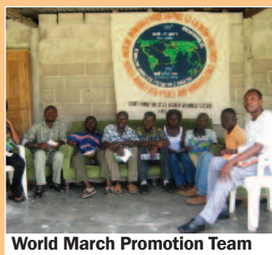
World March Promotion Team

The World March will start simultaneously on the 2nd of October with events in all of